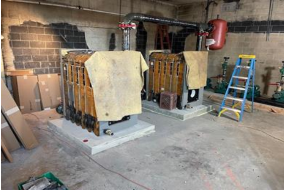
Smithtown Elementary October progress