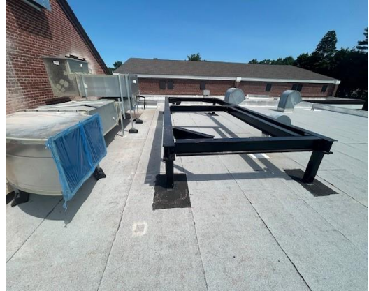
Progress Sept 2024