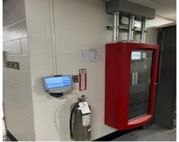
High School West