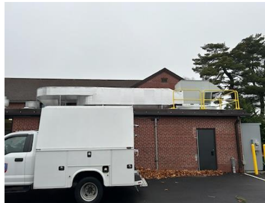
New roof top unit.