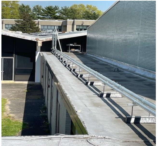
High School East Conduit installation for new Unit Ventilation project, Copper installation in FACS area, and Roof curbs on upper roofs installed