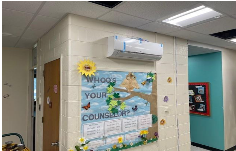
Great Hollow Middle School Unit Ventilation project- Ductwork installation on roof and Guidance Area Wall Pack installation