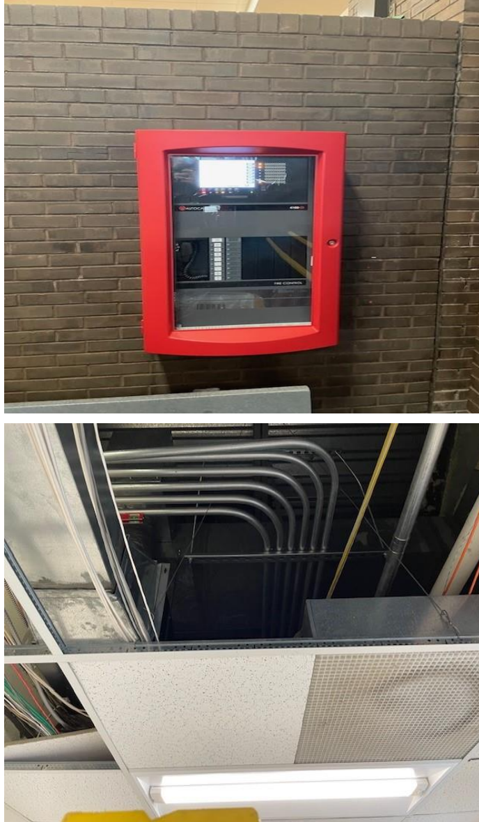
Fire Alarm Panel installation at Accomsett Middle School complete and New EMT runs started at St James Elementary School