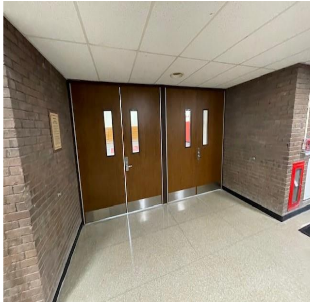
New district wide door Installation continues at Accomsett Middle School and Nesaquake Middle School along with access control