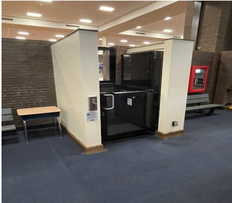
Accompsett Middle School Lift installation complete