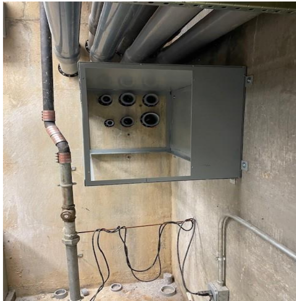
High School East Conduit installation for new Unit Ventilation project conduits and pull box installations