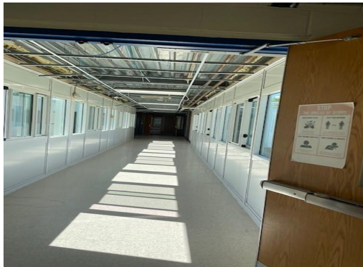
St James Elementary School Unit Ventilation project demolition in corridors and new electrical feeds from common room into boiler room