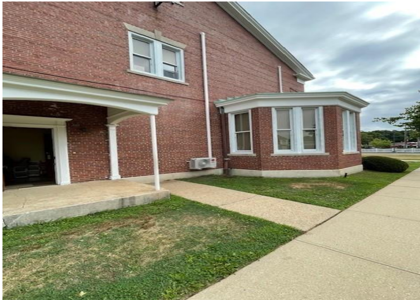
St James Elementary School Unit Ventilation project the hallway new ceilings installed, the classroom Unit ventilators are installed and the exterior units are being installed and tested