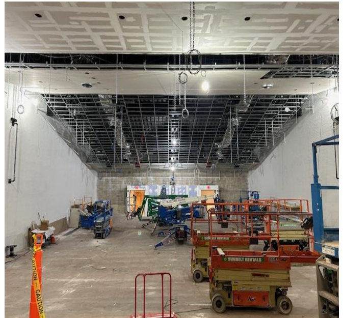
Progress on HSE Auditorium