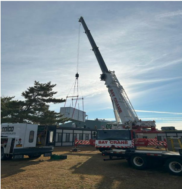
New auditorium A/C unit