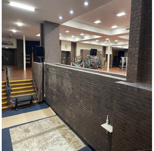
Accompsett Middle School Lift installation has commenced