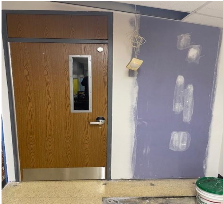
New Districtwide Door Installation continues- above are progress photos from Dogwood Elementary School and Tackan Elementary School installations