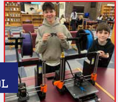
NESSAQUAKE MIDDLE SCHOOL

Nesaquake Middle School students are enjoying their new 3D printers and bringing some iconic characters like Darth Vader to life!