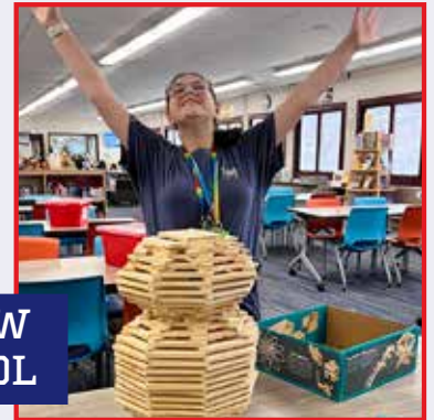
GREAT HOLLOW MIDDLE SCHOOL

The Great Hollow library has been bustling with activity over the past few months. Students have been working on elevator pitches and escape puzzles and enjoying “library lunches” where many different makerspace activities and challenges are offered each day.