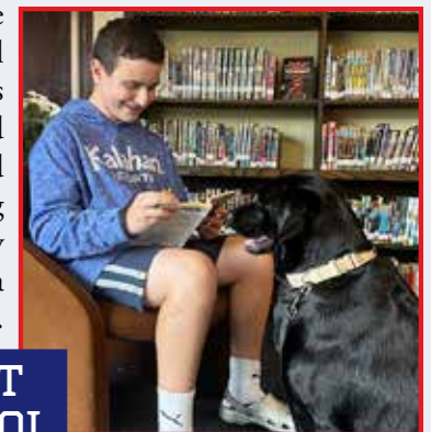
ACCOMPSETT MIDDLE SCHOOL

Tuesdays are for tails at the Accomsett Middle School Library! Each week, students welcome a special four-legged guest and offer a well-deserved treat, enjoy some calm petting time or practice their literacy skills by reading aloud to a nonjudgmental canine listener.