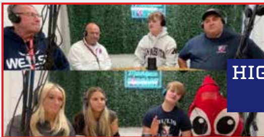
HIGH SCHOOL WEST