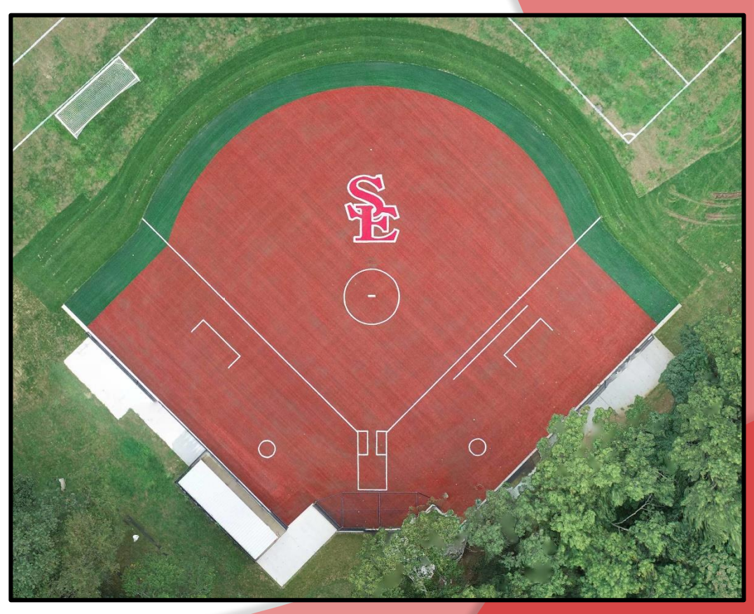
Smithtown East Synthetic Turf Softball Infield