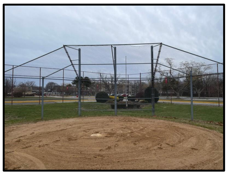
Smithtown East Baseball Field