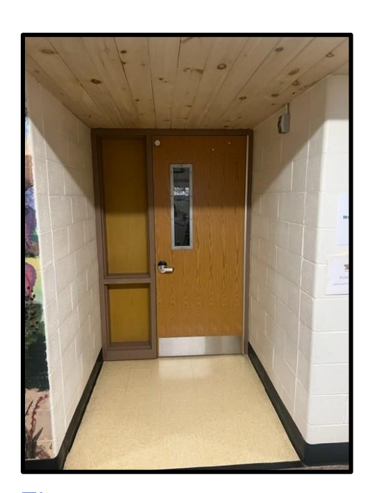
Smithtown Elementary Door Replacement