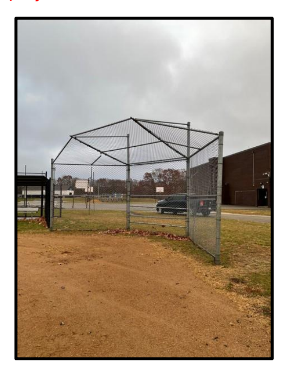
Smithtown West Softball Field BEFORE