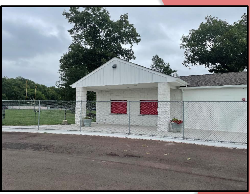
Smithtown East Concession Stand and Bathroom Facilities