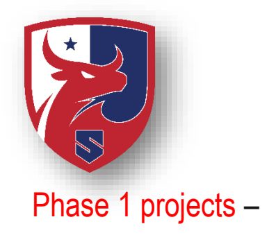
Smithtown East HS Lighted Bollards out to Student Parking Lot