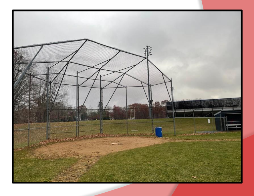
Smithtown West Baseball Field BEFORE