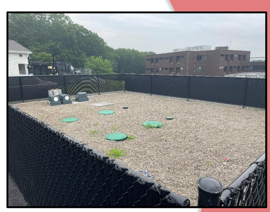
Suffolk County Health Department Required "Innovative and Alternate On-site Wastewater Treatment System"