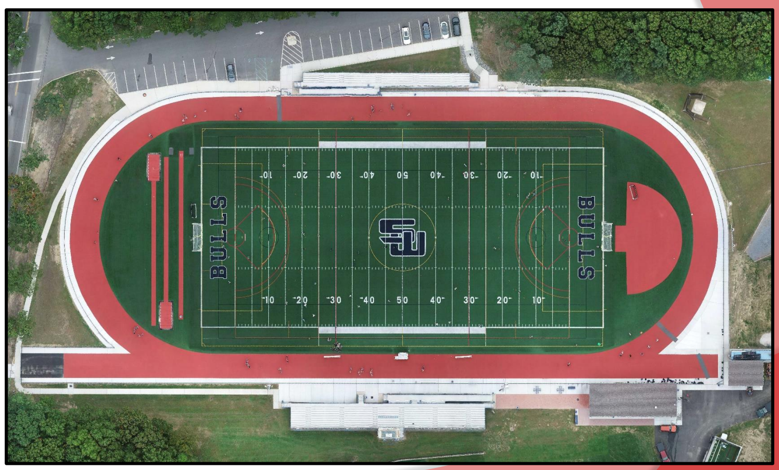
Smithtown West Synthetic Turf Stadium Field