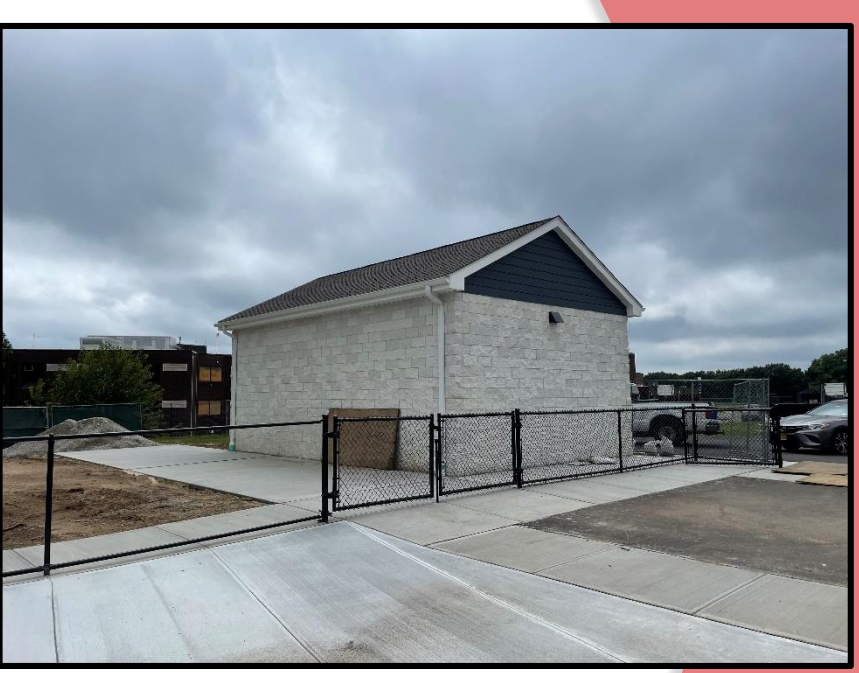
Smithtown West Grounds Garage