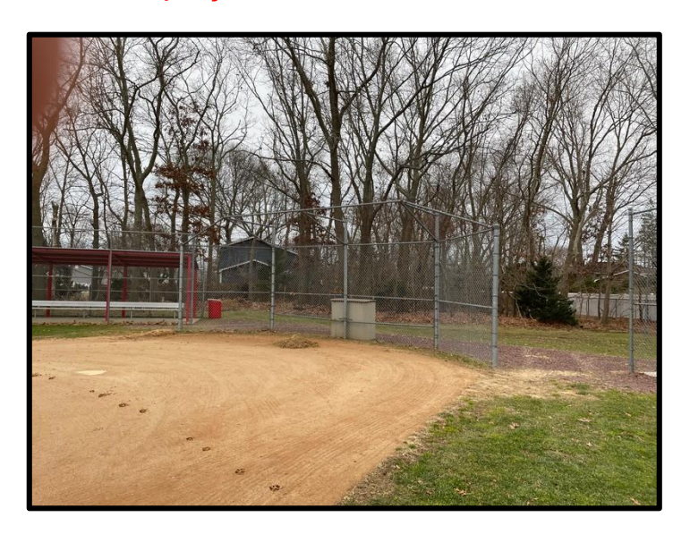
Smithtown East Softball Field