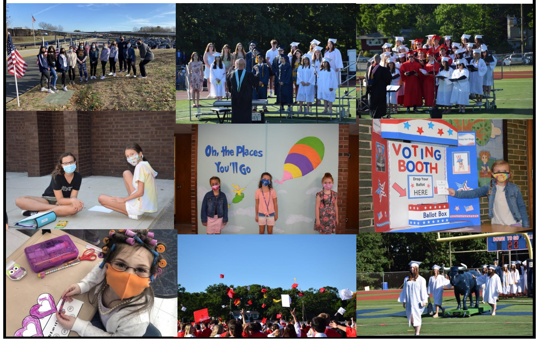
NOTE: This district events calendar is subject to change. Consult the online calendar for school events and for the most current in for mation: www.smithtown.k12.ny.us.

All members of the school community are expected to abide by the Code of Conduct. Complete copies of the Code of Conduct are available for review in each school building. You may pick up a copy at the SCSD District Office or refer to the Policy Manual, Section 5300, on our website by clicking <u>here</u> - www.smithtown.k12.ny.us