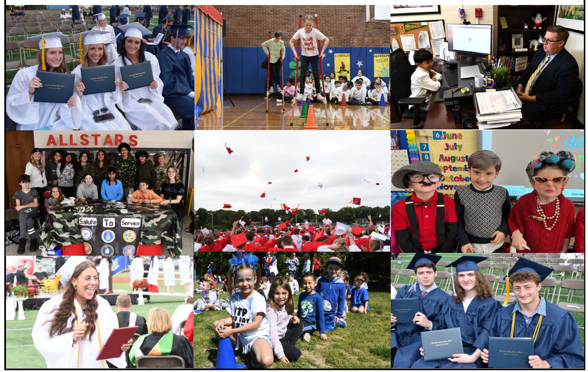
NOTE: This district events calendar is subject to change. Consult the online calendar for school events and for the most current information: www.smithtown.k12.ny.us.

All members of the school community are expected to abide by the Code of Conduct. Complete copies of the Code of Conduct are available for review in each school building. You may pick up a copy at the SCSD District Office or refer to the Policy Manual, Section 5300, on our website by clicking here - www.smithtown.k12.ny.us