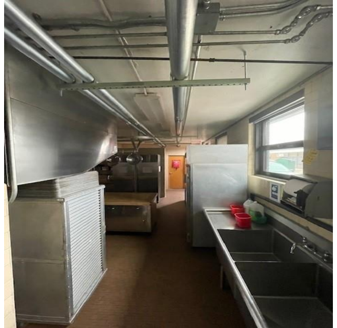
Smithtown Elementary School new conduit installation in progress for the Unit Ventilator project