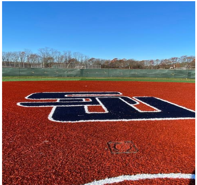
Synthetic turf installed at softball infield. Smithtown West logo installed behind pitchers mound.