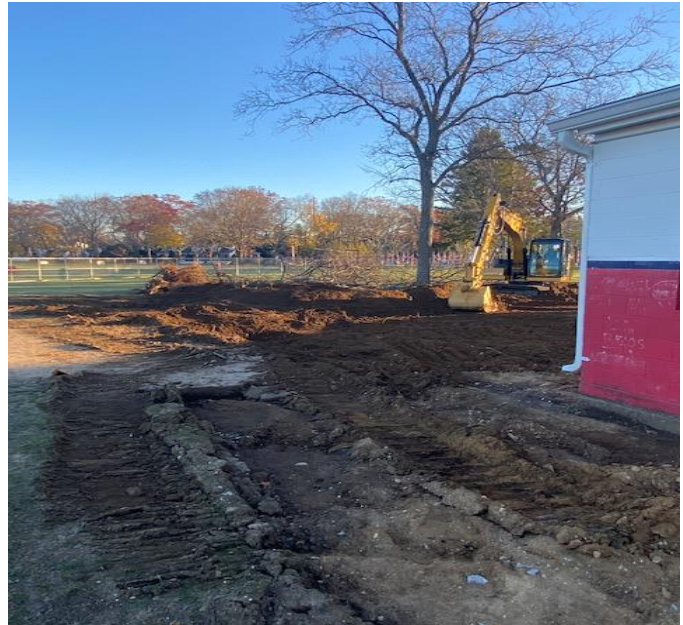
Security fencing erected and site demolition commenced at the existing Fieldhouse at HS East.