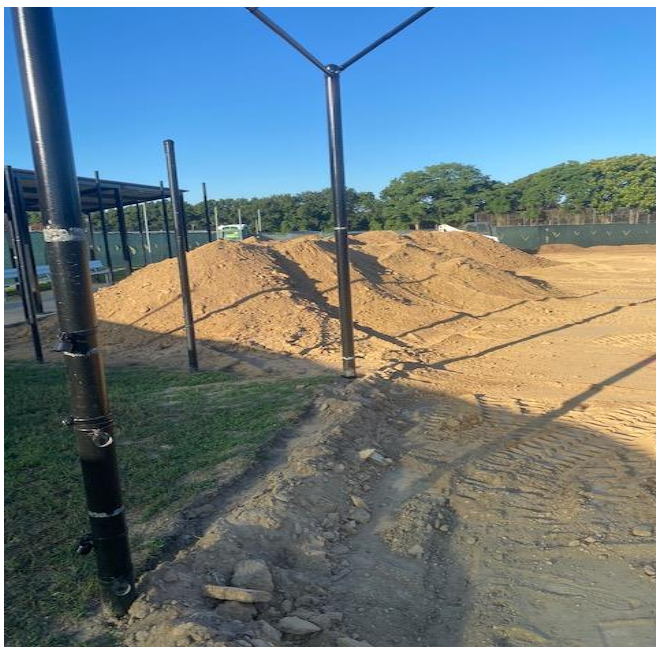
Demolition of Varsity Softball & Baseball Fields including removal of topsoil and realignment of baseball field.