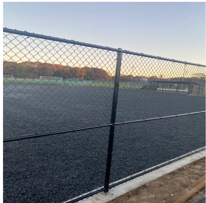
Upon establishing subgrade, gravel fines installed over flat pipe drainage system. Awaiting synthetic turf install.