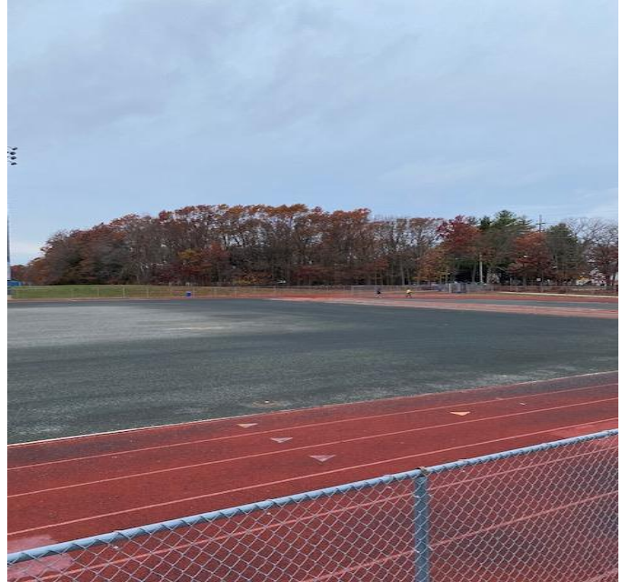
Removal of existing synthetic turf completed at stadium field. Additional gravel fines installed as required.