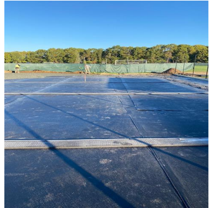
Corrugated drainage piping installed to at perimeters of softball and baseball fields. Piping to be pitched to drywells.