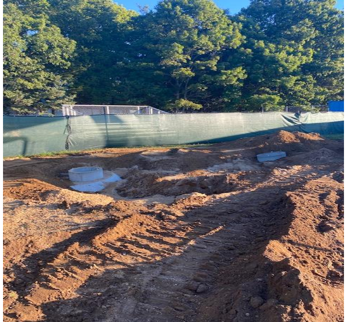
Storm drywell systems installed in foul territory outside field of play to collect storm water at softball field and baseball fields.