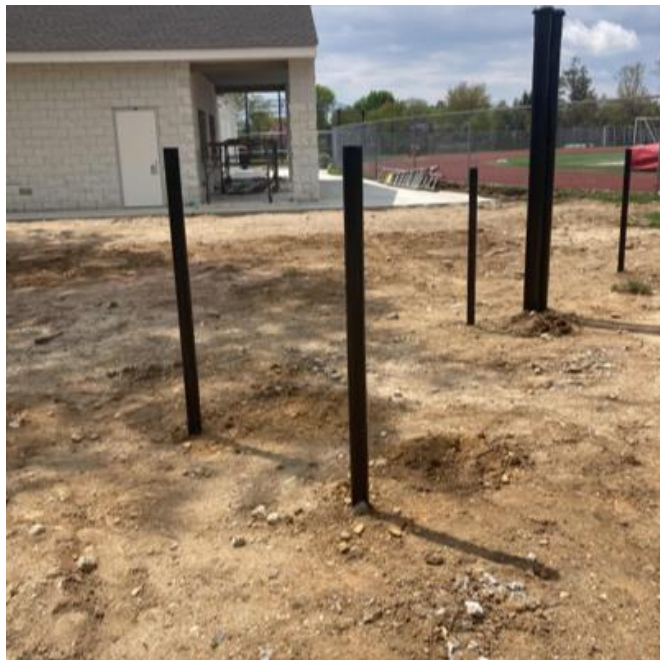
East Field House – Complete densglass in preparation for stucco, tape and sand, storage and septic area fencing