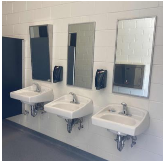
West Field House – Installed all doors, landscape/pave, install kitchen cabinets, install toilet accessories